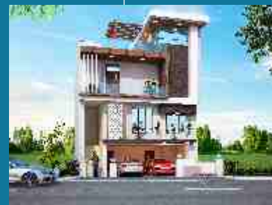
77-A, Vishnupuri, durgapura, Jaipur